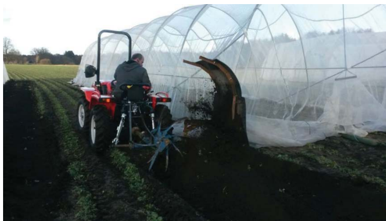
Photo 2 Hilling up soil by tractor with a modified ridge hilling machine